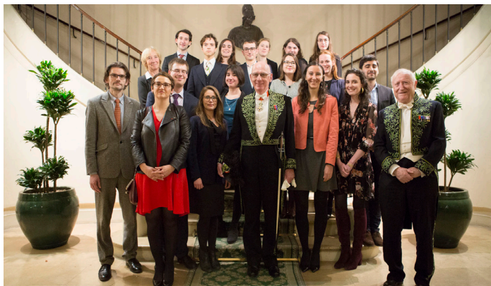
Graduates 2017 under the dome of the Institut de France